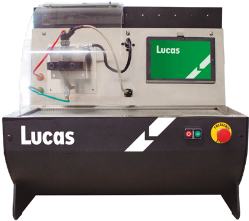
EDT 315 - LDFT1207

All of the Lucas Diesel Systems testing equipment is designed with a strong commitment to environmental care and to guarantee the minimum risk for the diesel specialist professional .